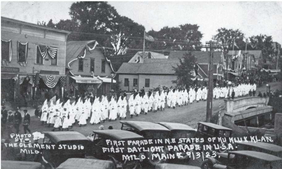
KKK Parade in Milo, Maine, 1923.

According to several accounts, the tendency of small Maine towns to have strong social and civic clubs, in which "fraternalism and civic organizations dominated local society," created a framework in which the Klan could grow especially strong. 18 The Klan presented itself as a respectable social club and directed its message to the "little people"—middle class businessmen, housewives, ministers, doctors, and community leaders. Understanding the nature of Maine communities, the organization began to focus its efforts on winning elections and influencing politics as an effective means of achieving its goals. Klan leadership was concerned that immigrants would gain control of local, state, and federal government by electing representatives from their communities. Accordingly, by the mid-