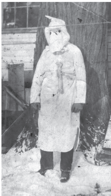
KKK member in Southwest Harbor